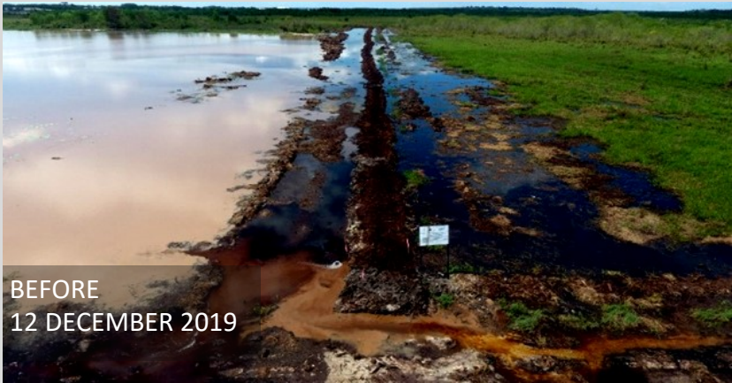
BEFORE 12 DECEMBER 2019

Maintenance of 305m clay dyke and continue water table monitoring.