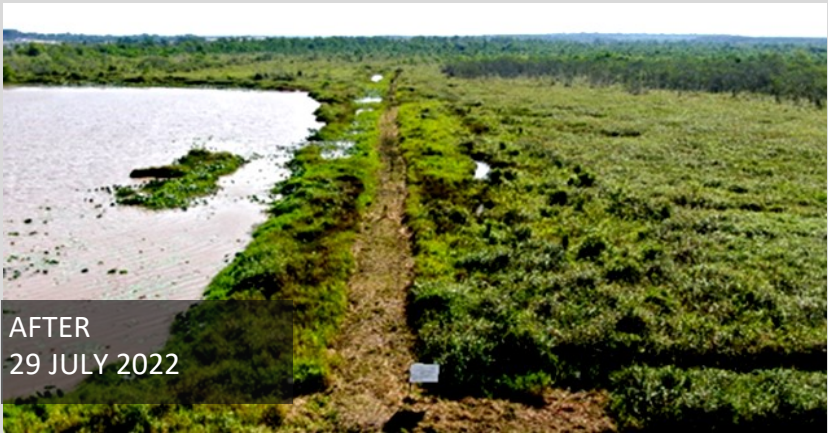
AFTER 29 JULY 2022