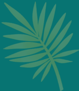
Maintenance of two (2) hectares of planted trees at FC102, Raja Musa Forest Reserve, Selangor.