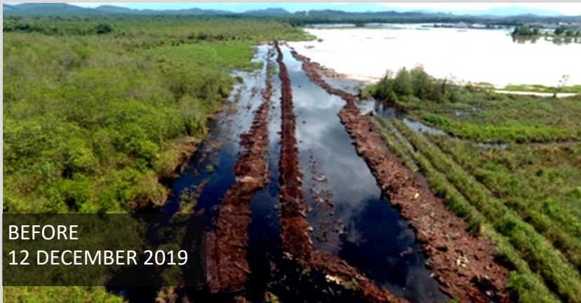
BEFORE 12 DECEMBER 2019