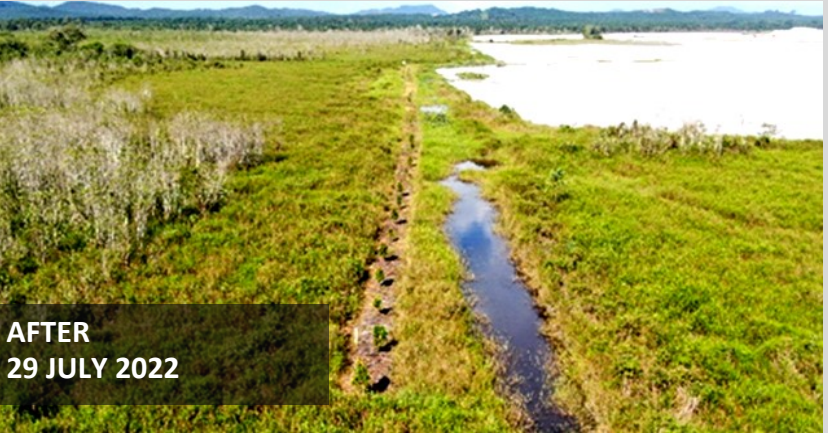
AFTER 29 JULY 2022