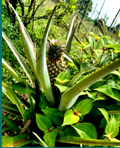
Variety of vegetables harvested from our community gardens in both Penchala River and Selangor River Basin

Maintenance of 305m clay dyke and continue water table monitoring.